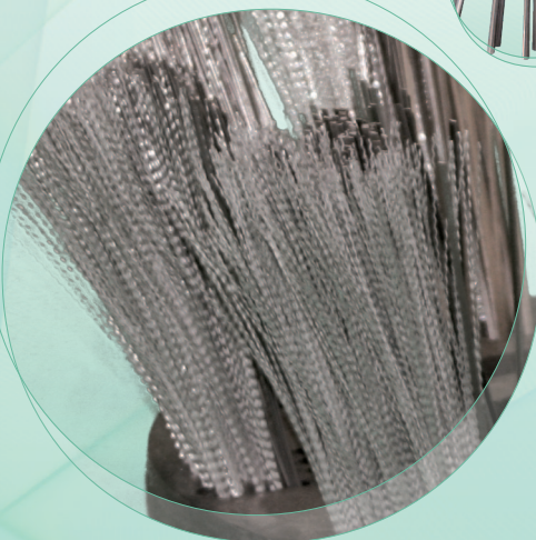
Filled with crimped steel + flat steel