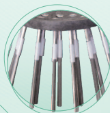
Filled with high tensile flat steel wire solid strand

WARNING... can only be used on road sweepers which are powerful enough to drive such a brush